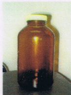
Amber Glass 1L